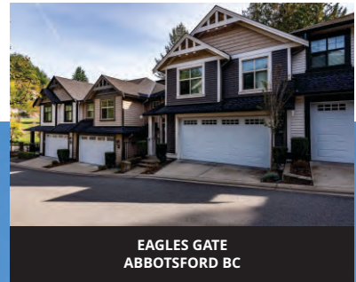
EAGLES GATE ABBOTSFORD BC