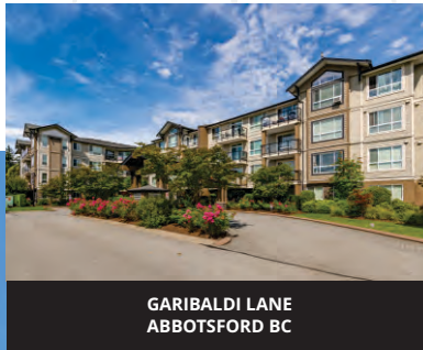
GARIBALDI LANE ABBOTSFORD BC