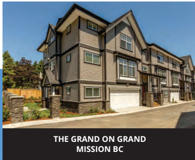
THE GRAND ON GRAND MISSION BC

Today, Noort Homes head office is in New Westminister and remains a family owned company with a second and third generation continuing to build on their legacy for unmatched customer service and craftsmanship. Along with their focus on custom single family homes, the family's expertise has grown to include land development, multi-family developments, commercial centers, and industrial parks.